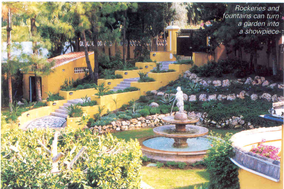
Rockeries and fountains can turn a garden into a showpiece

From its own nurseries in Estepona, Jardineria Natural can supply an A-Z of plant species with names as exotic as their appearance and which have a special rarity value to anyone used to living in more northern latitudes: names like plumbago and dama de noche, jacaranda and flamboyant, bird of paradise, yucca and mimosa. The majority come from central